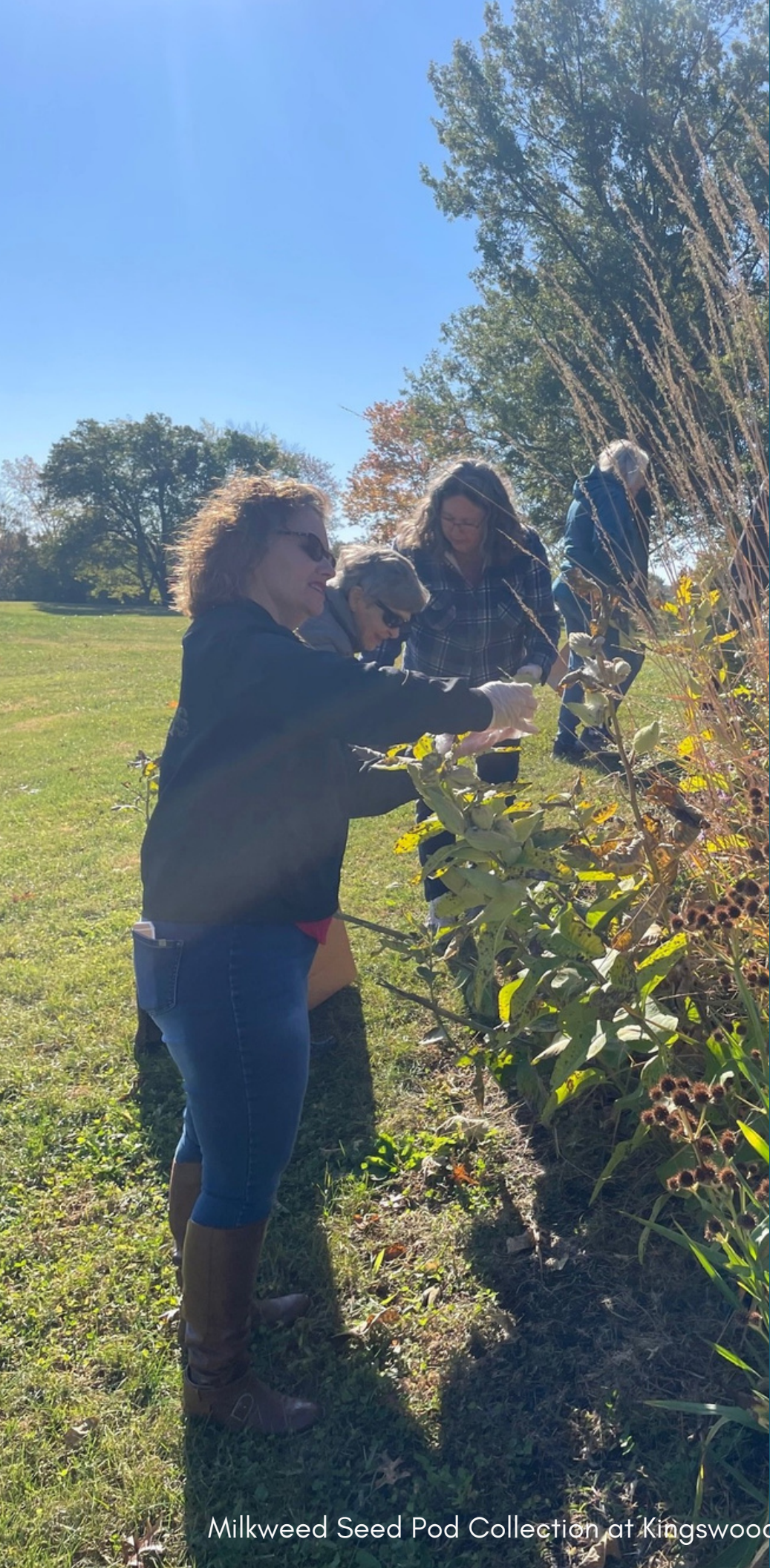
Milkweed Seed Pod Collection at Kingswood