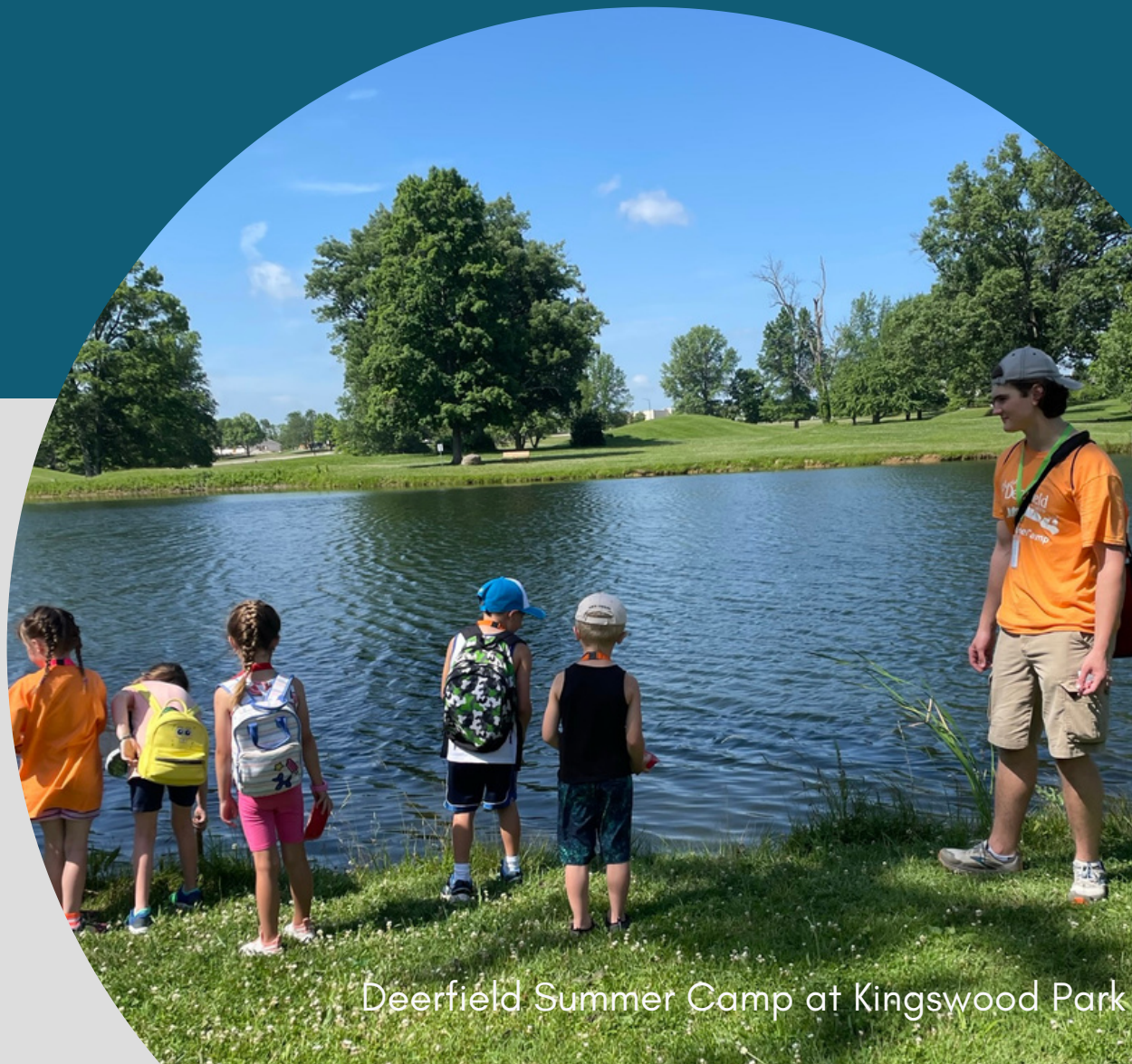
Deerfield Summer Camp at Kingswood Park