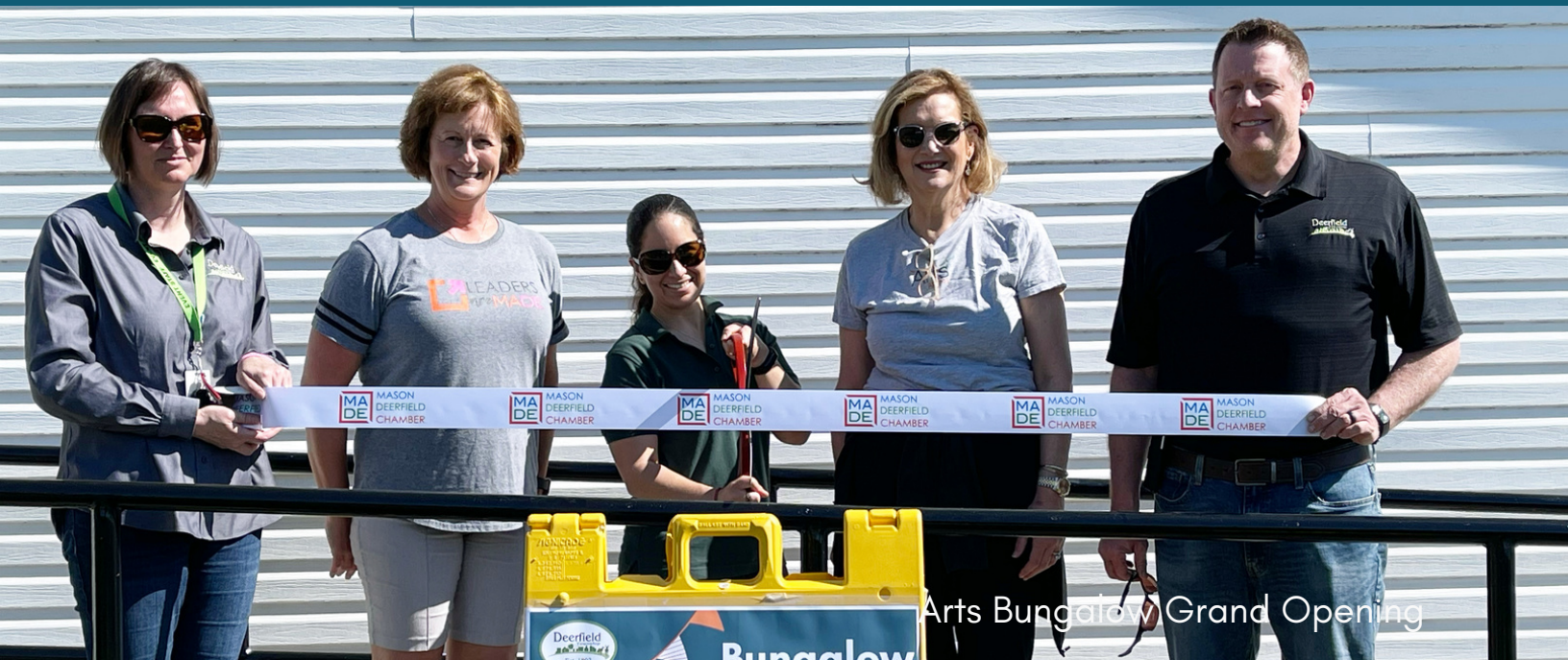
Arts Bungalow Grand Opening