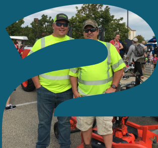
People Make It Possible