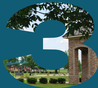
Community Spaces to Reflect, Gather, & Play