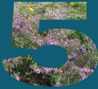
Completed Park Maintenance & Capital Improvement Projects