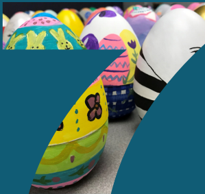
Recreation Behind the Fun & Games