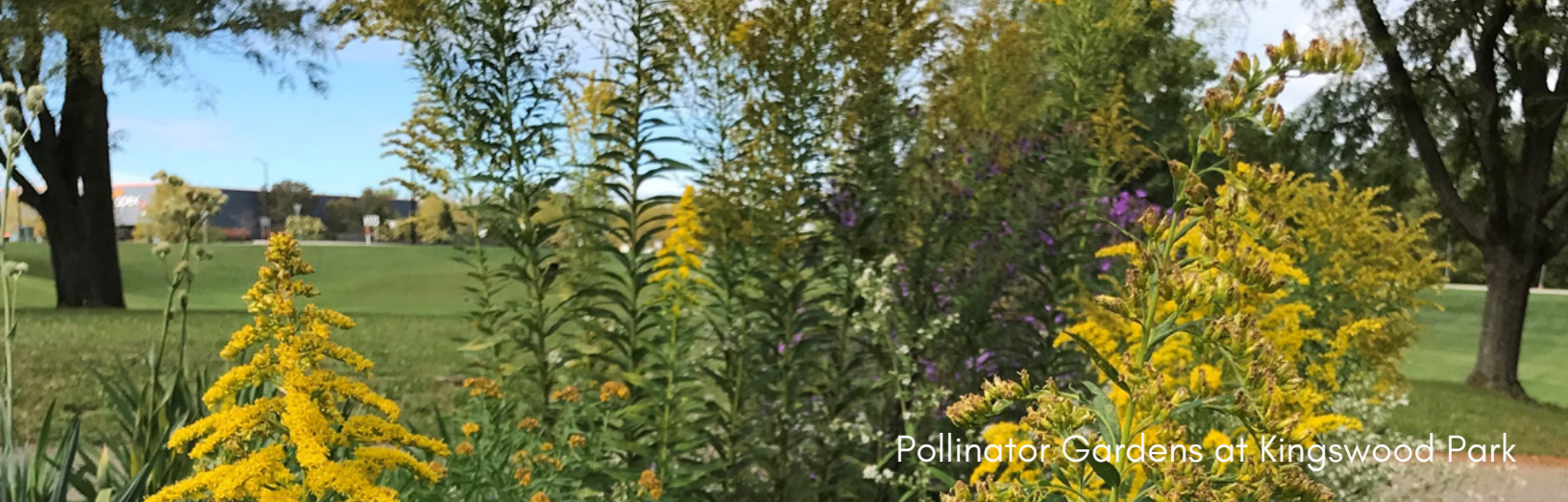
Pollinator Gardens at Kingswood Park