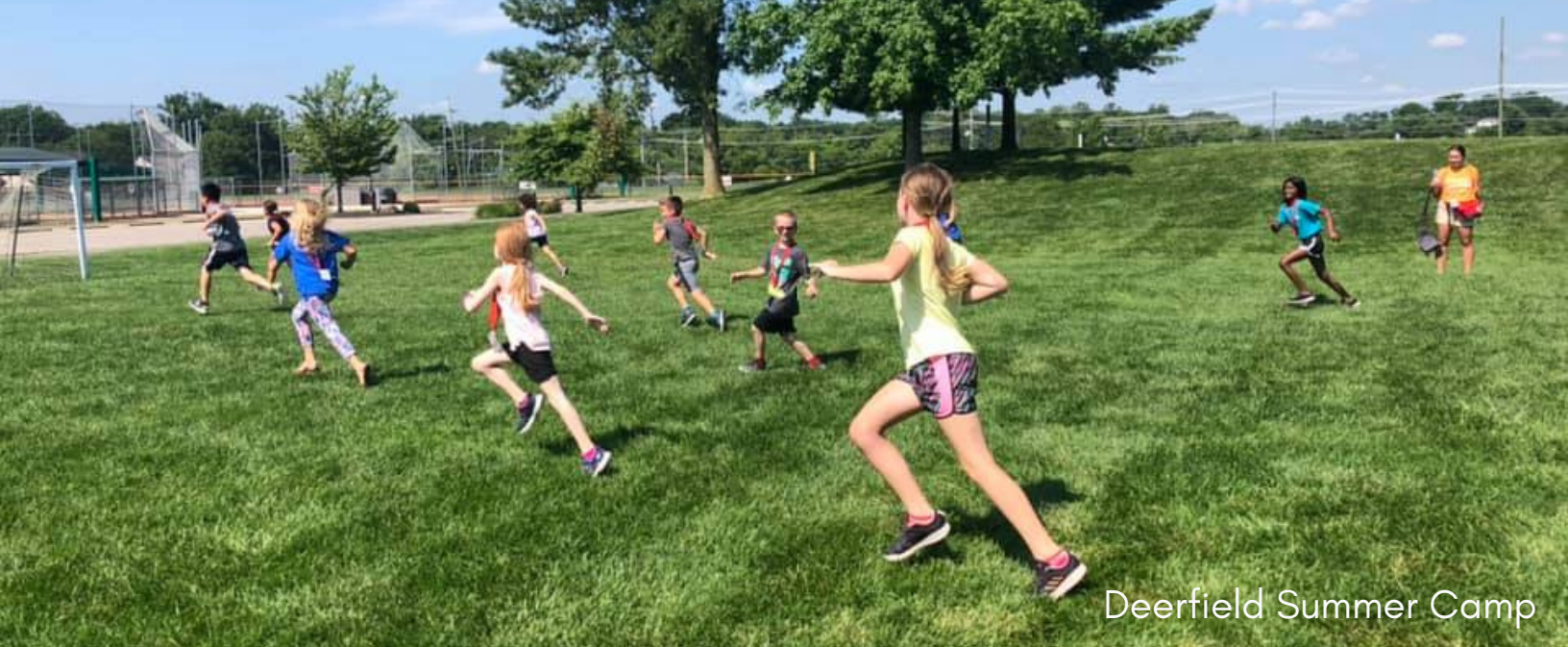
Deerfield Summer Camp