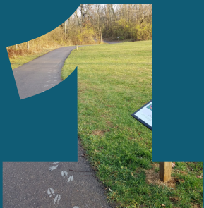
Parks & Recreation Vision, Mission, and Core Values