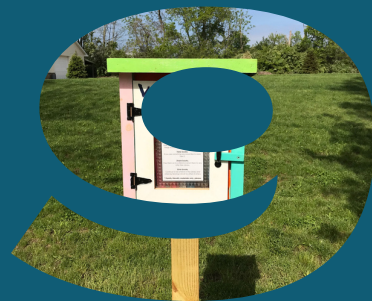
Recreation Administration, Special Projects, Master Plan Action Items