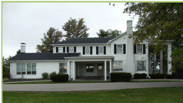
Side View of Drive-Thru Covered Entry

The first floor of the Snyder House may be rented for private events and is an ideal location for wedding receptions, family gatherings, parties, and celebrations.